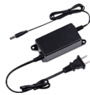
PFM320 12V 2A Power Adapter